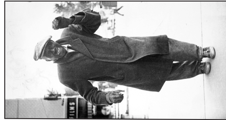
PHOTOS FROM MPW.5 This year marks the third time MPW has been in Boonville. The first two were in 1953 and 1998. MPW.50 in 1998 was historic because it was the first workshop to use color film. Rangefinder will feature past photos from Boonville as well as pictures and stories from this week's workshop.