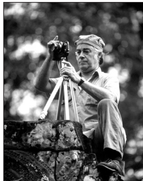
Wilbur E. "Bill" Garrett Photographer MPW 5,6, 8 Faculty MPW 9, 10, 15, 21-23, 25-27, 29-32, 35, 46