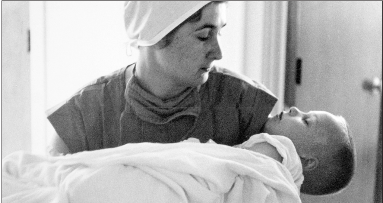
8, Lexington 1956