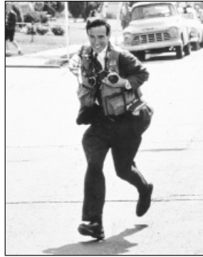
Bill Eppridge Photographer MPW10 &11 Faculty MPW16, 21, 26, 28-45