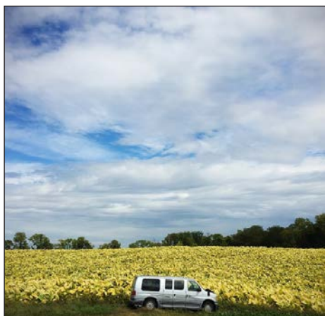
Demetrius Freeman Old school van used to transport workers to the tobacco fields outside of Platte City, Missouri.