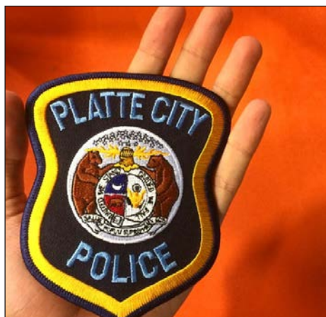
Nick Agro A cool moment.