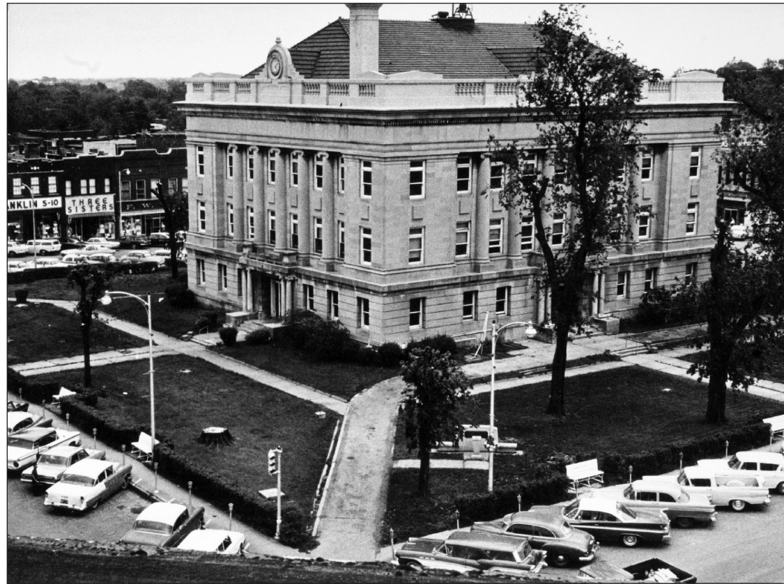
MPW 15- 1963